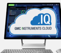
IZYTRONIQ CLOUD COLLECTION*