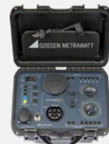
PROFITEST E-MOBILITY M513R