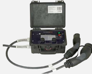
PROFITEST H+E TECH M525B