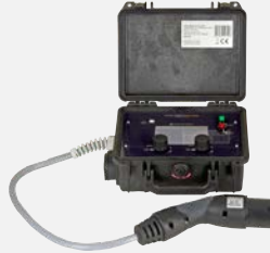
PROFITEST H+E BASE M525A