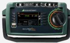
SECUTEST PRO M705C