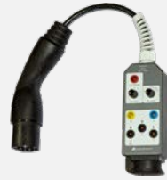
PRO TYP II TEST ADAPTER Z525A