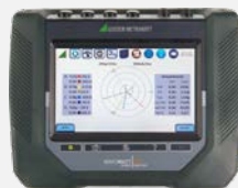
MAVOWATT 240 M820B