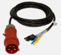
Adapter for PROFITEST E-MOBILITY Z570B