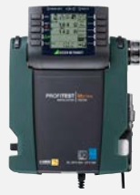
PROFITEST MXTRA M535D