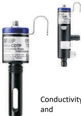
Conductivity and Temperature