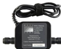
Conductivity and Temperature